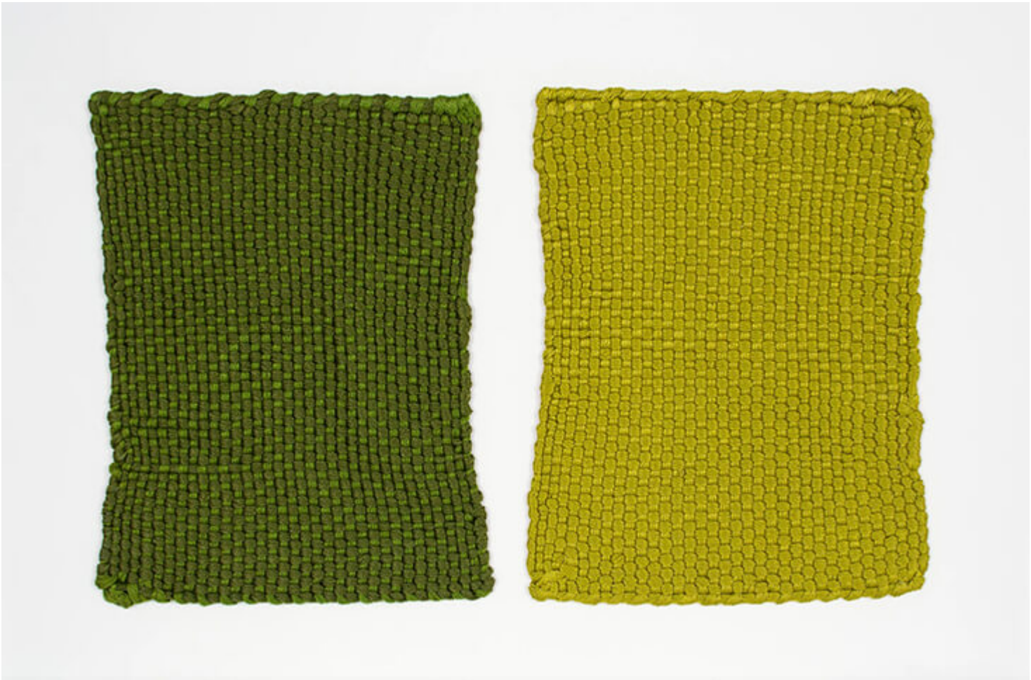
Fenêtres Moss Saffron, 1970