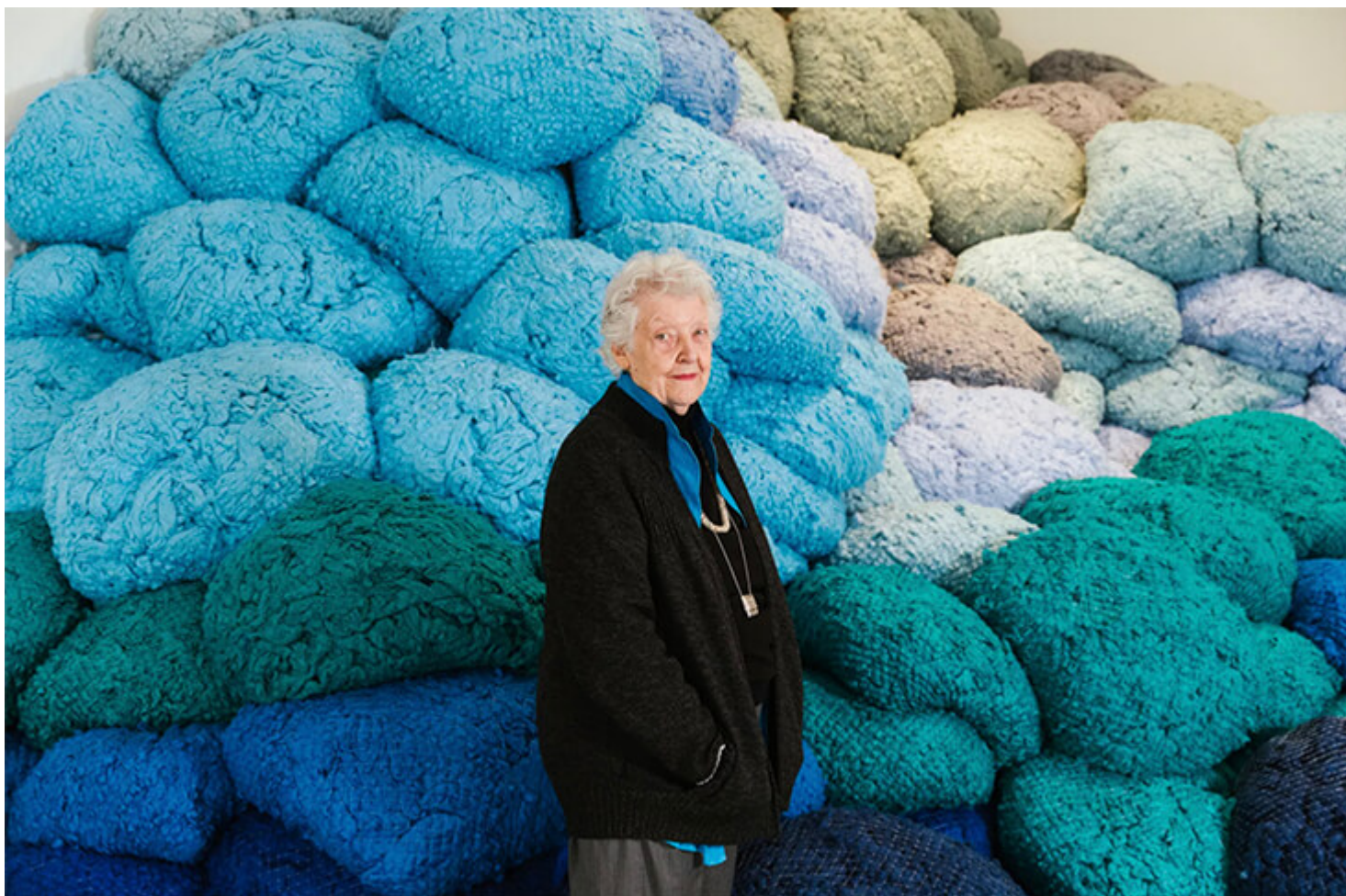
Sheila Hicks at The Hepworth Wakefield

While it's clear that Hicks has had a profound impact on a whole host of cotemporary artists who see in her work the wild and spontaneous potential of thread, that was never Hicks' intention. She says, "I don't want a legacy. I just want to have fun while I'm here." But after a lifetime of making weavings in just about every size, material and variation possible, she still continues to emphasize the importance of challenging herself, and expecting the unexpected. "I don't want to go do something I know how to do," she says, "I want to do something I don't know how to do."